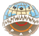
Institute of Physics of the Earth of Russian Academy of Sciences